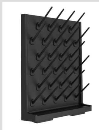
Drip stick Qty:27