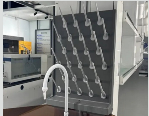
PP lab drip rack

Essential for draining lab ware ,test tubes, beakers. these use hollow grid designs to prevent contamination. Made of PP or 304 stainless steel. Multi-layered with slots; some have waste trays. Choose by material, capacity, and ease of cleaning for efficient lab use.