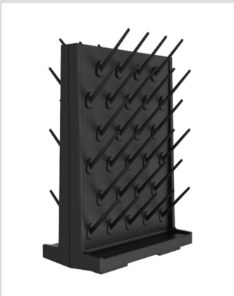
Drip stick Qty:54